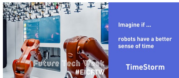
Fig. 3: A card featuring selected projects covered by the FETFX editorial team