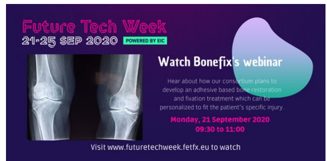
Fig. 2: A card showcasing an event during Future Tech Week