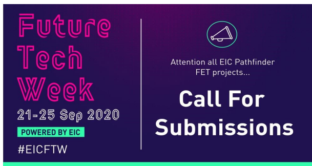
Fig. 1: A card featuring a call for participation

A special Twitter and Instagram hashtag #EICFTW was announced and shared across the FET network. This was used not only to trace the conversation around Future Tech Week but also to fish out the posts from social media and display them directly on the Future Board , alongside multimedia posts uploaded directly by EIC Pathfinder-FET projects. The hashtag helped to ensure a constant interaction with FET projects as part of the promotion. #EICFTW was mentioned in tweets a total of 850 times during the month of September 2020.